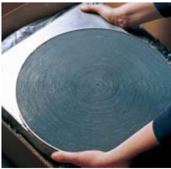
» Diesel Oxidation Catalysts Your Best Bet For Diesel Compliance

If you run stationary diesel engines, it's a safe bet you're generating more than power. Diesels produce carbon monoxide (CO), soot, volatile organic compounds (VOCs) and other hazardous air pollutants (HAPs), sulfur acids, odor, and more. That means health risks – and strict environmental regulations.